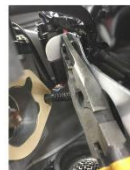
1e-4/5 Remove cable harness support bracket by first removing black plastic push in connector. Use pliers to press backside of small push through and pull from other side to release. Then press tab on larger connector and pull down and away. Save gasket after removing from silver plate.