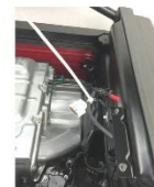
1c-5 Secure pump connectors with supplied tie wrap.