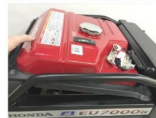
1c-4 Lift back edge of tank - pull back, up and away from back of unit to clear front frame bracket.