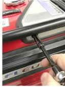
1a-1 Remove #10mm side bolt holding corner cover on