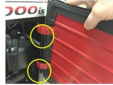
1a-4 Lift off door to gain access to air cleaner side of generator (left side when looking at front)