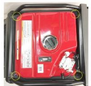
1c-2/3 Locate and remove four #10mm corner bolts with washers as final step before lifting out tank.