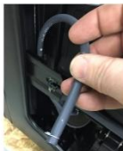
1d-1/2 Gently twist tank vent tube and insert into forward hole on backside of door latch for safe keeping.