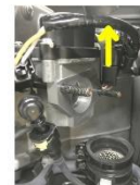
1e-6 Gently push fuel injector harness up to make room for assembly.