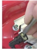
1b-2 Disconnect fuel line fitting from fuel pump by pushing down on yellow tab then pushing in fuel hose quick connect fitting, then pull out fitting (pushing in first makes release easier).