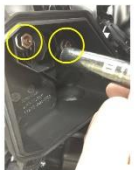
1e-1/2/3 Remove final piece of airbox from throttle body by removing inner two #10mm nuts, loosening clamp below and then swinging plastic box off studs and pulling up.