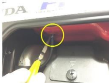
1c-1 Disconnect gas tank vent tube from underneath side of gas tank. No fuel should spill doing this.