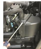
1d-5/6 Remove air box cover by prying up on 4 corner clips then lift off vent tube from top corner.