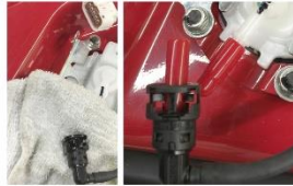
1b-3/4 Catch small amount of any remaining gasoline with small rag and use supplied caps to seal both ends.