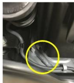
1d-3/4 Pull up canister vent tube from white plastic clip and pull out of hole to make room for adding new vent line.